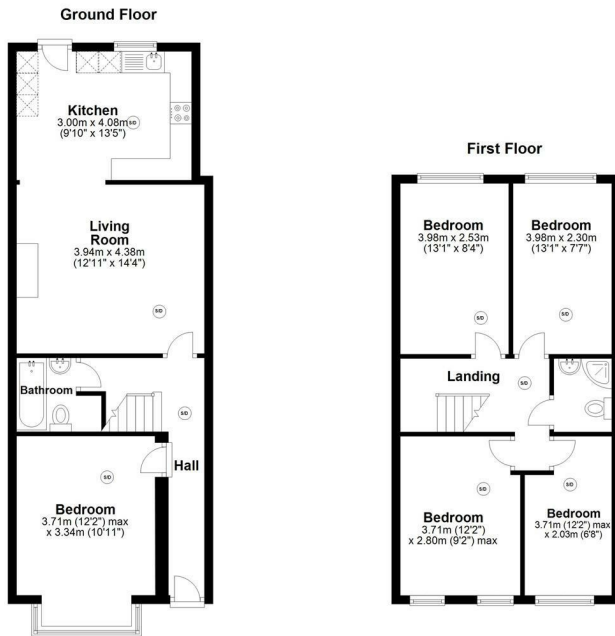
134 Milner Road, Birmingham